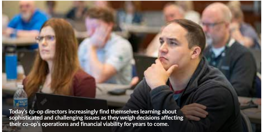
Today's co-op directors increasingly find themselves learning about sophisticated and challenging issues as they weigh decisions affecting their co-op's operations and financial viability for years to come.