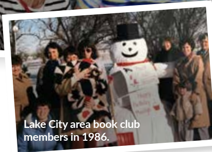
Lake City area book club members in 1986.

These friends know a book club is much more than books. It's a support system, a second family. Once you're in, you're in for life.