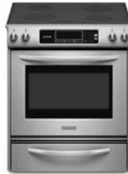
One of the most common stove tops available to consumers is the electric stove top.