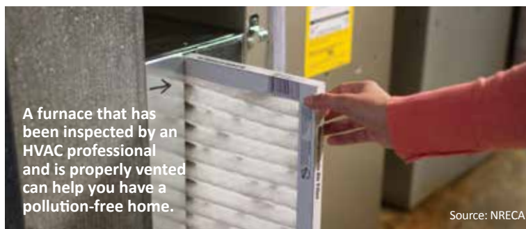
A furnace that has been inspected by an HVAC professional and is properly vented can help you have a pollution-free home.