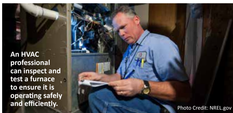
An HVAC professional can inspect and test a furnace to ensure it is operating safely and efficiently.