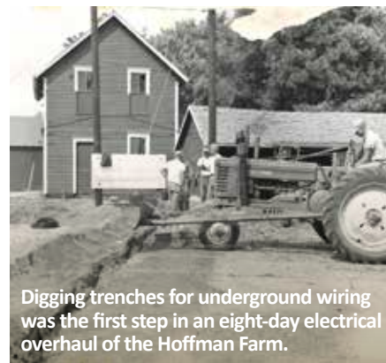
Digging trenches for underground wiring was the first step in an eight-day electrical overhaul of the Hoffman Farm.