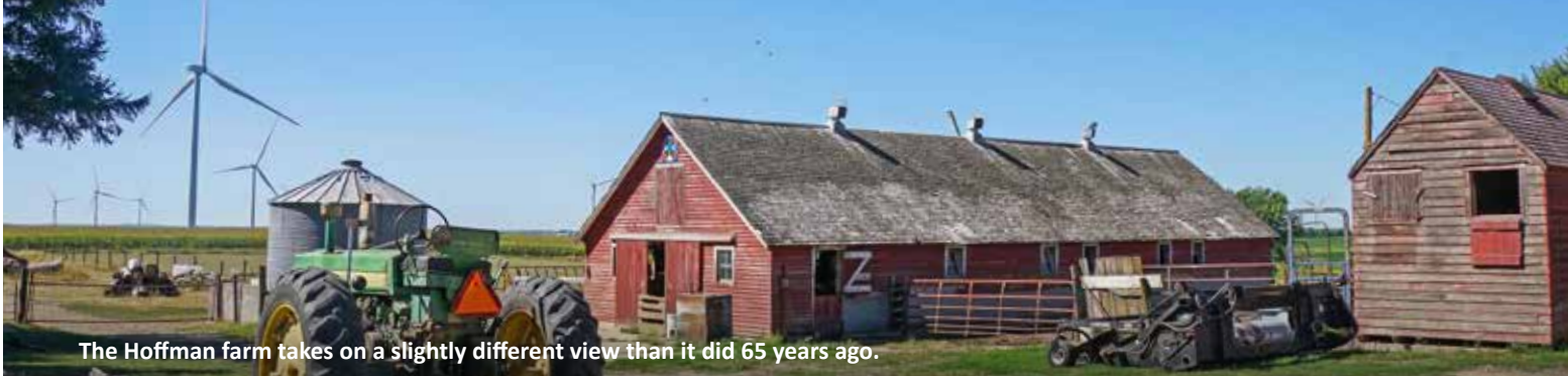
The Hoffman farm takes on a slightly different view than it did 65 years ago.